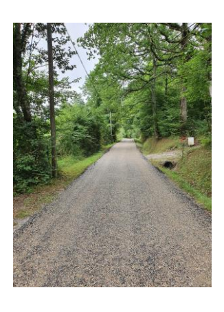
After the bad weather, rehabilitation of the Bourdil road