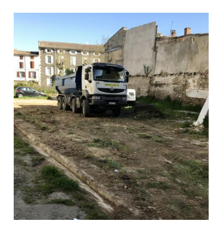
A new car park next to the library