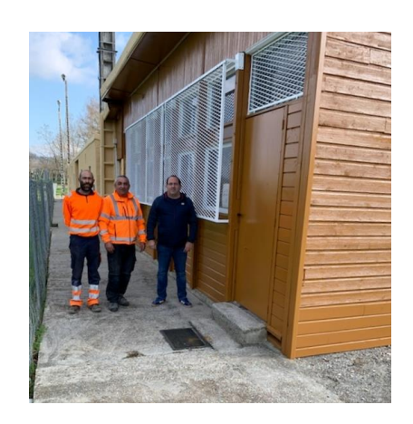
Facelift for the Club House and Football locker rooms