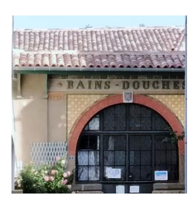
A completely new roof for the library