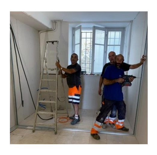
Doctor's Office Reception office into