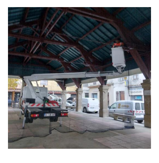
Installation of an anti-pigeon net under the hall