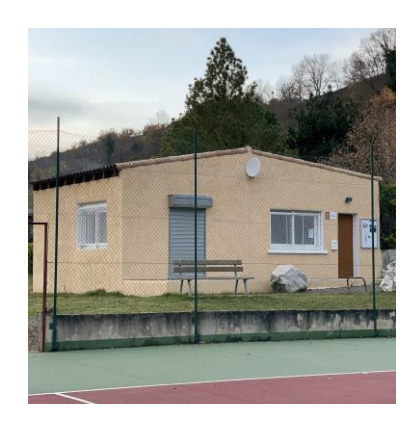
Renovation of the Tennis Club House