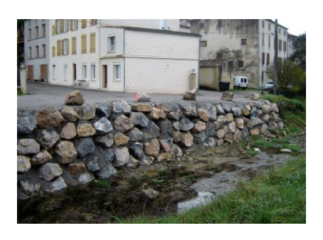
Banks of the Chalabreil